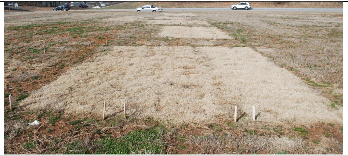
Fall 2021 companion crop planting in Yadkin county on 15 February 2023 – 16 months (64 weeks) after planting.

Zoysiagrass seed, sprigs, and companion crops were applied in the fall (20-22 October 2021 and 5-19 October 2022) and spring (22-29 April 2022 and 4-5 May 2023) of each year. The Moore County site received an additional summer (July) planting in 2021 that was not repeated in year two. This study was arranged in a randomized complete block design with whole plots measuring 6.1 m \times 1.5 m with three replications. The study area received no supplemental irrigation beyond natural rainfall.