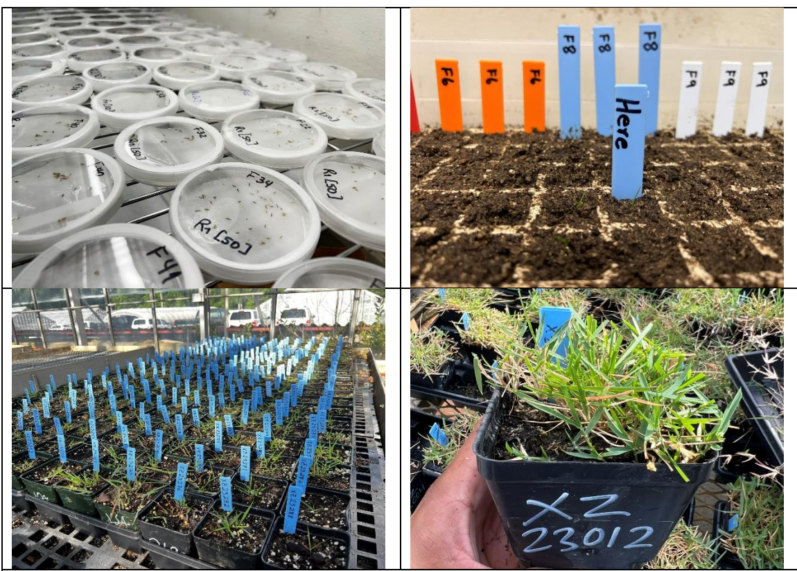
Germination process for families recovered from the seeded crossing program. Seeds harvested from each female x male paring were considered a family and were germinated in petri plates. Once seedlings emerged they were transferred to floatrays where families were planted in the same row. Once seedling were at the 6-8 leaf stage, they were transplanted into individual pots.

Due to low recovery rates in the first round of germination experiments, all extra seeds were germinated in a second round of experiments. A total of XXX individuals were recovered from XX individual families. These families will be planted at the Lake Wheeler Turfgrass Field Lab in a replicated trial late spring 2024. Plots will be evaluated for yield and germination over 2024-2026.